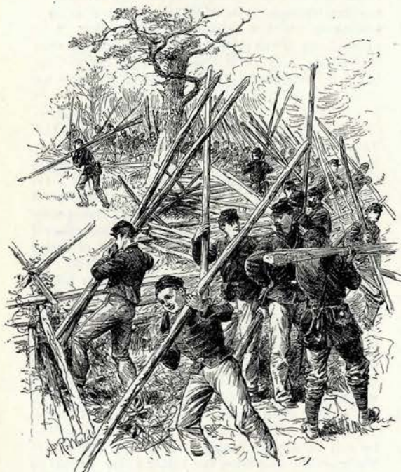
INCIDENT OF SHERMAN'S MARCH—THE FATE OF THE RAIL FENCE.

to be transferred through the city, to the depot of the Charleston and Savannah Railroad, and there to await further orders from me. I at once called on General Hardee, whom I found in bed, in his room at a private house, and showed him my conditional authority, from Governor Brown, to withdraw my command from the Confederate service proper. I said to him: "You know that the militia of this State cannot be legally ordered beyond its limits without a special act of the Legislature. But if you can satisfy me that it is absolutely necessary that my command shall go into South Caro-