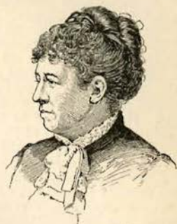
Julia D. Grant

eight years. Soon after her return home she met Lieut. Grant, then of the 4th infantry, stationed at Jefferson barracks at St. Louis, and in the spring of 1844 became engaged to him. Their marriage, deferred by the war with Mexico, took place on 22 Aug., 1848. The first four years of her married life were spent at Detroit, Mich., and at Sackett's Harbor, N. Y., where Capt. Grant was stationed. In 1852 Mrs. Grant returned to her father's home in St. Louis, her health not being sufficiently strong to accompany her husband to California, whither his command had been ordered.