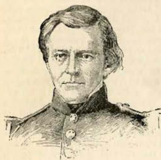
U. S. Grant Sept. 27th. 4th July.

I propose to move immediately upon your works." The garrison was surrendered the same day, unconditionally. The capture included 14,623 men, 65 cannon, and 17,600 small-arms. The killed and wounded numbered about 2,500. Grant's loss was 2,041 in killed, wounded, and missing. This was the first capture of a prominent strategic point